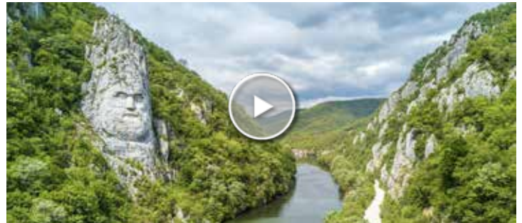
Iron Gates King Decebalus