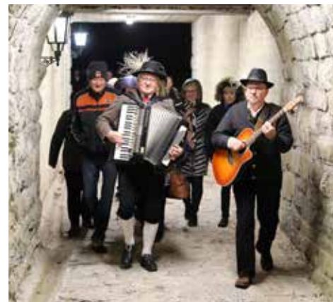
Enjoy an evening sampling famous regional wines in Spitz, Austria.