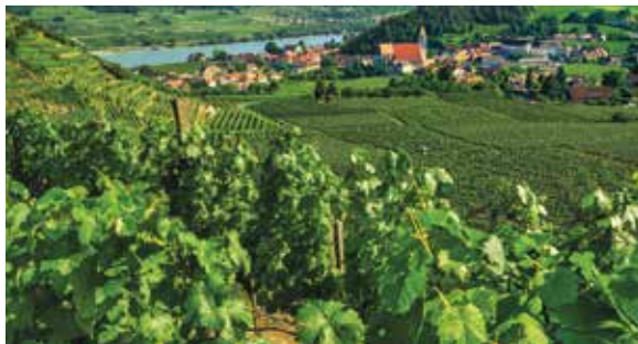
Vineyards in Austria's Wachau Valley