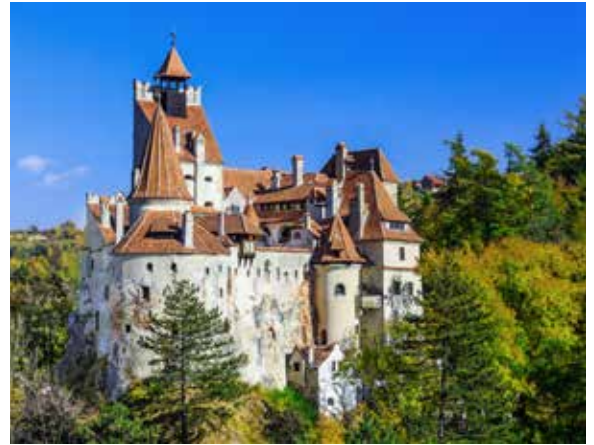
Bran Castle, Bran, Romania