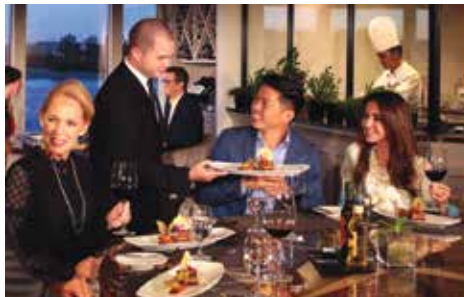
Delicious Cuisine at The Chef's Table