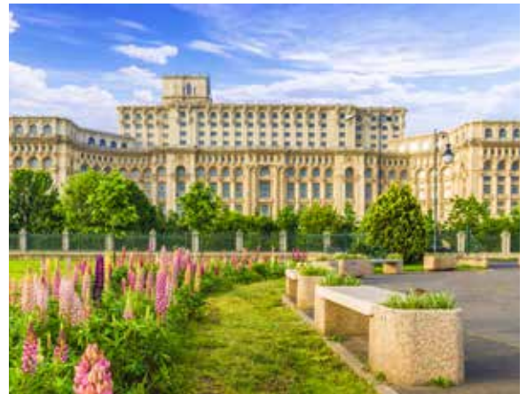
Palace of the Parliament, Bucharest, Romania