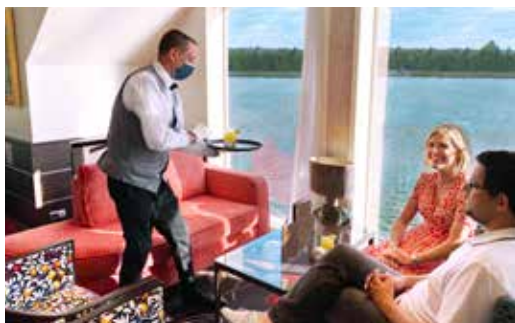
Enhanced safety measures and unparalleled service