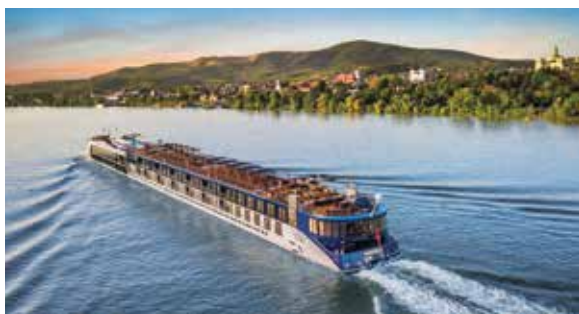
AmaViola sailing on the Danube River