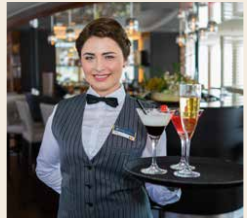
Our crew always goes above and beyond