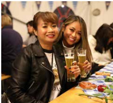
Celebrate Oktoberfest year-round at this special event held in Vilshofen, Germany.

AmaWaterways has forged strong relationships with local officials in off-the-beaten-path destinations, giving our guests exclusive access to intimate, authentic experiences ashore.