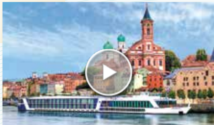
Passau, Germany The "City of Three Rivers," Passau is renowned for its magnificent St. Stephen's Cathedral, home to the second-largest pipe organ in the world.