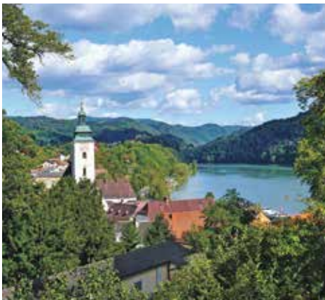
Be treated to a private castle visit and reception in Grein, Austria.