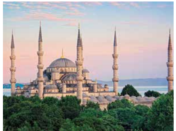
Blue Mosque, Istanbul, Turkey