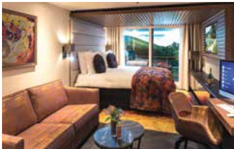
AmaMagna Balcony Suite

With fewer guests on board, you can enjoy the luxury of space to unwind, relax and reconnect with your loved ones. Our public areas, including lounges and restaurants, are never crowded.