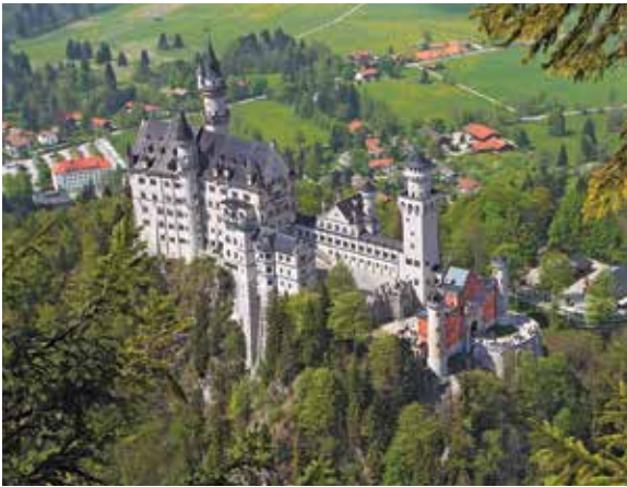
Neuschwanstein Castle, Munich, Germany

Available on: Magna on the Danube , Melodies of the Danube and Blue Danube Discovery