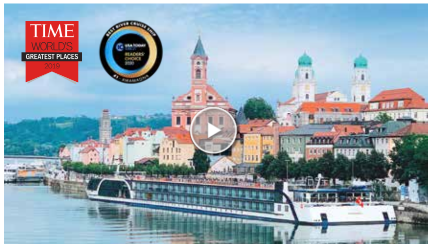
AmaMagna in Passau, Germany