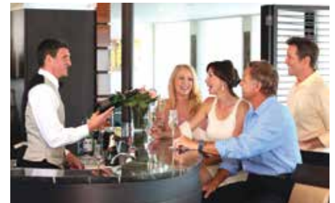
Enjoy Sip & Sail Cocktail Hour