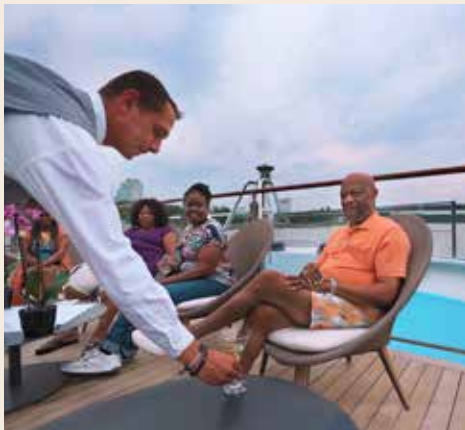
Unparalleled personalized service