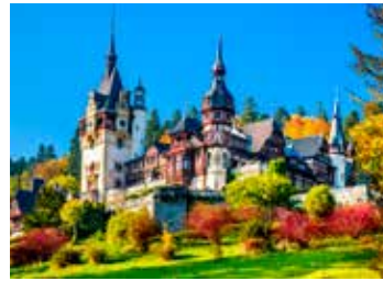
Peleş Castle, Sinaia, Romania

Cruise through the Danube River's iconic Iron Gates. Enjoy the blending of nature, art and architecture at sites such as Bulgaria's Belogradchik Rocks and the Rock-Hewn Churches of Ivanovo. Expand your world and your palate in a region rich in culture, with distinctive gastronomy including banitsa pastries, Szekszard wine and Serbian plum brandy. Plus, connect with knowledgeable Cruise Managers and crew who often hail from the countries we visit and can offer you unique expertise on the region's history as well as local hotspots.