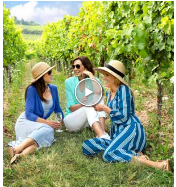
Wine Tasting in Germany

Visit our website for hosted Wine Cruise dates.