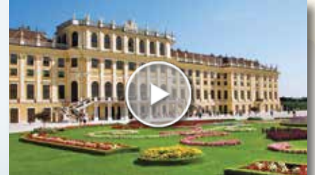
Vienna, Austria The heart of the Austro-Hungarian Empire, Vienna is awash with stunning Baroque treasures, including the awe-inspiring royal Schönbrunn Palace.