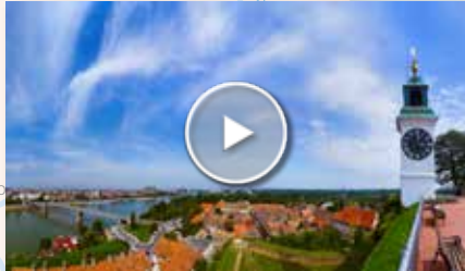
Novi Sad, Serbia Rich in tradition and culture, Novi Sad is known as the "Athens of Serbia," and is home to the mighty Petrovaradin Fortress, which no army has ever breached.