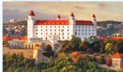
Bratislava, Slovakia Known as the "Crownation City of Kings," Bratislava boasts a gleaming castle that was home to the Hungarian crown jewels for nearly 200 years.