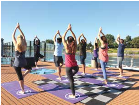
Enhance your best self