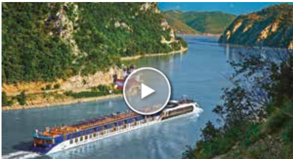
Cruising through the Iron Gates

Touch history in Hungary, Croatia, Serbia, Bulgaria and Romania, as you sail along the exotic lower Danube. Celtic fortifications, medieval towns and grand cities, along with the natural beauty of pastoral landscapes and the Danube's famed Iron Gates, showcase the best of eastern Europe. Nature lovers will relish the opportunity to see Bulgaria's natural wonder, Belogradchik, a fairytale stone world of fantastic shapes associated with interesting legends; or to bike through Belgrade's sprawling Kalemegdan Park. Wine connoisseurs will have a chance to taste history from the centuries-old wine-growing hills dating back to the Romans in Ilok, a royal and vinous town. Be treated to the flavours, sights, sounds and cultures of this diverse swath of the continent.