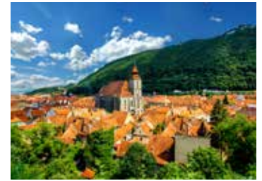
Black Cathedral, Braşov, Romania