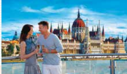
Budapest, Hungary The "Queen of the Danube" is home to several UNESCO World Heritage Sites and the third largest Parliament building in the world.