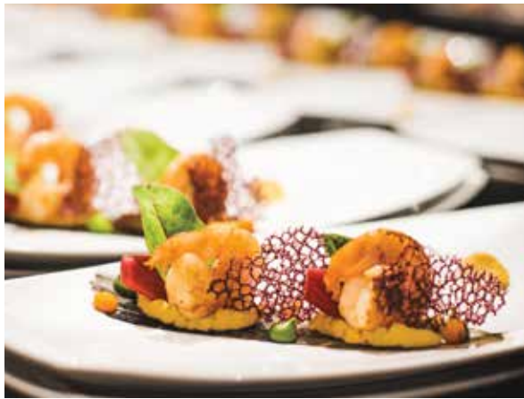
Exquisite locally-sourced cuisine