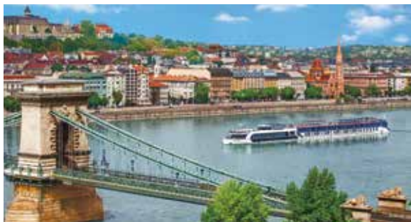
AmaSonata sailing through Budapest, Hungary