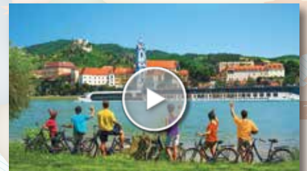
Dürnstein, Austria With world-famous apricots, wine, castle ruins and a striking blue church tower, charming Dürnstein is the "Pearl of the Wachau."