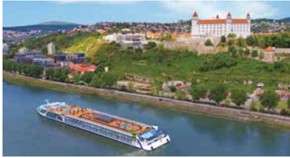
AmaMagna in Bratislava