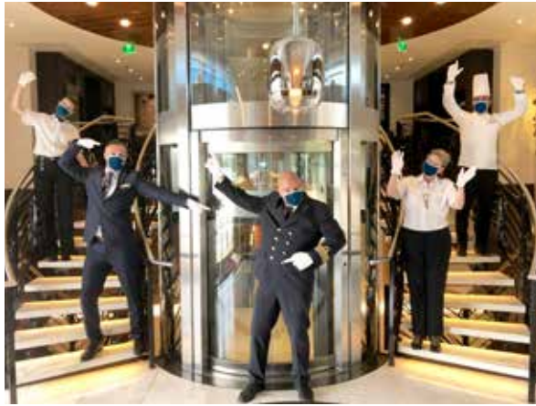
Warm-hearted crew who make your safety a top priority