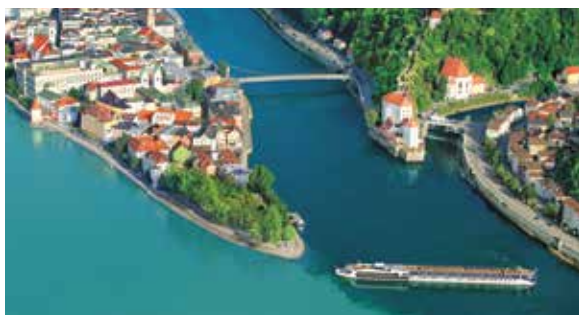
AmaPrima sailing through Passau, Germany

Uncover Europe's history starting in fairytale Prague and concluding in Budapest. In between, cruise through the Main-Danube Canal and the UNESCO-designated Wachau Valley. Explore medieval cities like Nuremberg and Regensburg, and visit Vienna, where imperial dynasties built a harmonious blend of architectural wonders. Throughout your journey, get a feel for the land by biking, hiking and sampling delicate wines and hearty beers.