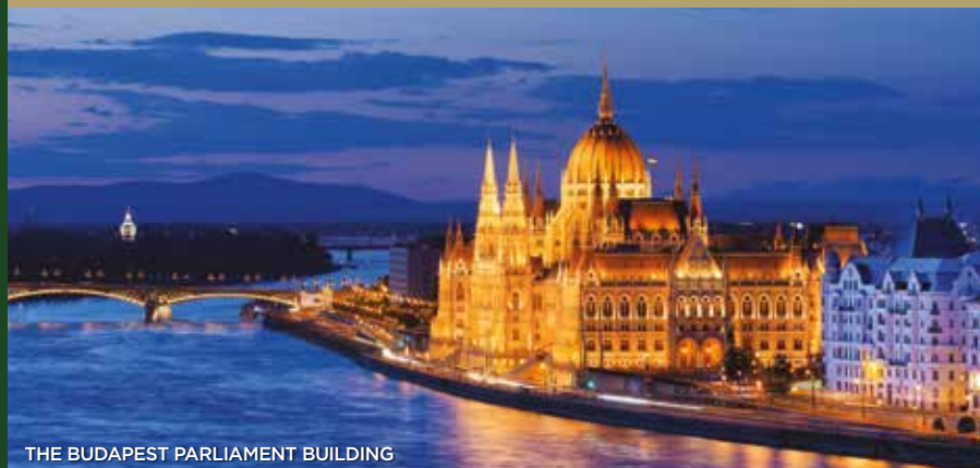
THE BUDAPEST PARLIAMENT BUILDING