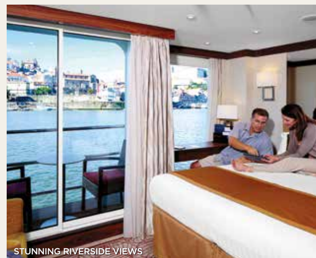
STUNNING RIVERSIDE VIEWS