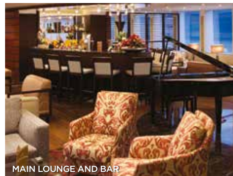
MAIN LOUNGE AND BAR